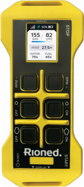
The new RioMote handset includes an LCD screen displaying information from the eControl Touch

RIOCONNECT; MACHINE DATA ON YOUR PHONE By means of an app, you can connect to eControl Touch. This way, it is possible to read data from your machine on your phone as well. Handy if you want to know how much water and fuel you have left before you leave.