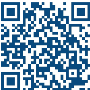
Scan QR-code for product video