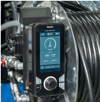
Standard on CityJet with V1505-CR T diesel engine

Key to the development is the inclusion of more real-time sensors, with operators now able to monitor pressure and flow, RPMs and fuel and water level at a glance. Sensors also continuously monitor machine components, with the eControl Touch displaying warning alerts and solutions when detecting impending machine malfunctions. This accurate monitoring of the condition of critical components enables users to reduce machine downtime and maintenance costs.